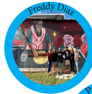
La Estrella Bakery