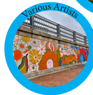
Underneath East Side of Court Street Bridge