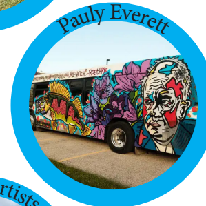
Traveling Around the City